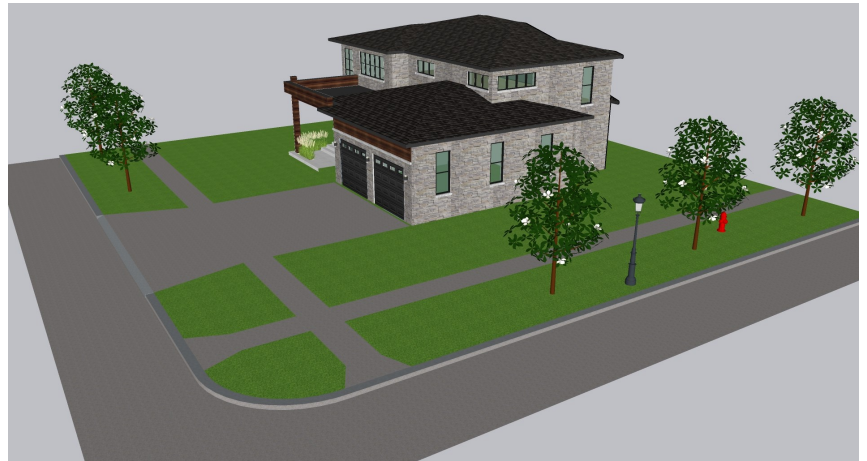
Typical Residential Property Spacing